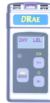
Comprehensive monitoring and detailed evaluation is key to success

EIC personnel will provide hands-on training on proper calibration methods. Other aspects of the training program include bump test procedures, identification of various alarm settings, and data logging procedures. Caring for CS equipment, and emerging trends in CS will also be covered.