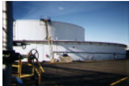
Aboveground storage tanks often fit the definition of permit-required confined spaces.

In the USA alone, more than 1.6 million workers enter confined spaces annually. Many of these workers suffer from injuries and